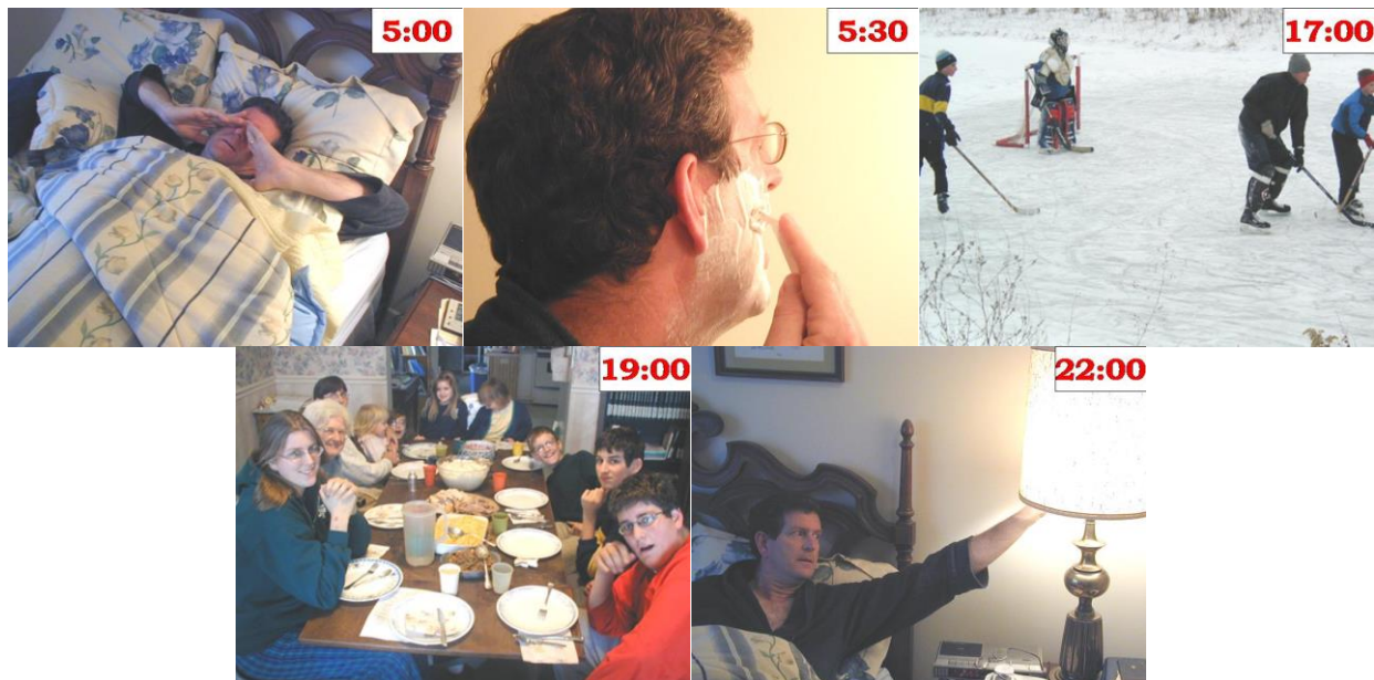
These are five photos from a 25-photo series (see lesson 2.15) that the ULAT's author had taken of himself to convey to his students aspects of his daily routine while still a classroom teacher.

Examples of such topics are found in the ULAT. While studying Unit 1, students are equipped to make a general self-presentation. They talk about their daily routine in Unit 2 and about some (fairly minor) problem they are facing in their lives while seeking proposed solutions from their classmates. In Unit 3, they share about situations in which they feel various emotions and also provide a description of someone who has significantly impacted their lives. With the vocabulary provided in Unit 4, they make PowerPoint presentations composed of photos of the exterior and interior of their homes and give their classmates a guided tour or they talk about the chores that each member of their family performs to help maintain the home. With all of these topics, it is the teacher who sets the example by first sharing about his or her life before inviting the students to do the same.