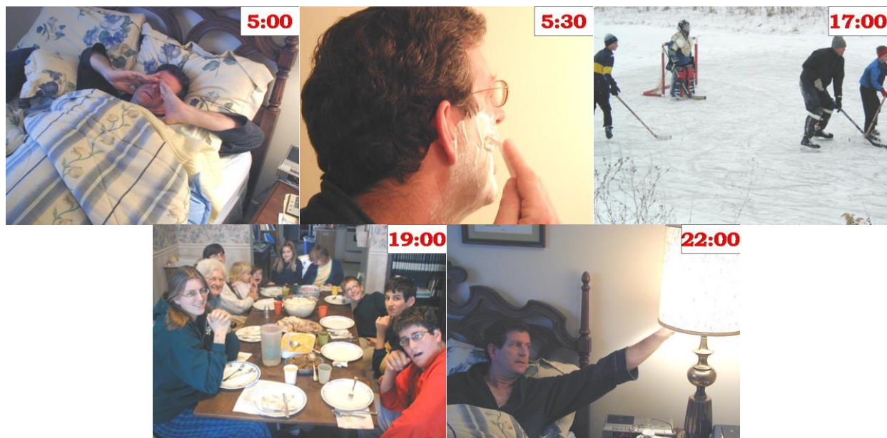
These are five photos from a 25-photo series (see lesson 2.15) that the ULAT's author had taken of himself to convey to his students aspects of his daily routine while still a classroom teacher.

Examples of such topics are found in the ULAT. While studying Unit 1, students are equipped to make a general self-presentation. They talk about their daily routine in Unit 2 and about some (fairly minor) problem they are facing in their lives while seeking proposed solutions from their classmates. In Unit 3, they share about situations in which they feel various emotions and also provide a description of someone who has significantly impacted their lives. With the vocabulary provided in Unit 4, they make PowerPoint presentations composed of photos of the exterior and interior of their homes and give their classmates a guided tour or they talk about the chores that each member of their family performs to help maintain the home. With all of these topics, it is the teacher who sets the example by first sharing about his or her life before inviting the students to do the same.